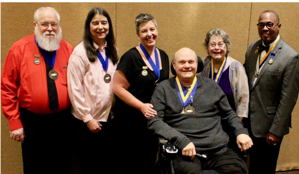
MoSRT 2019 Fellows Pictured are: