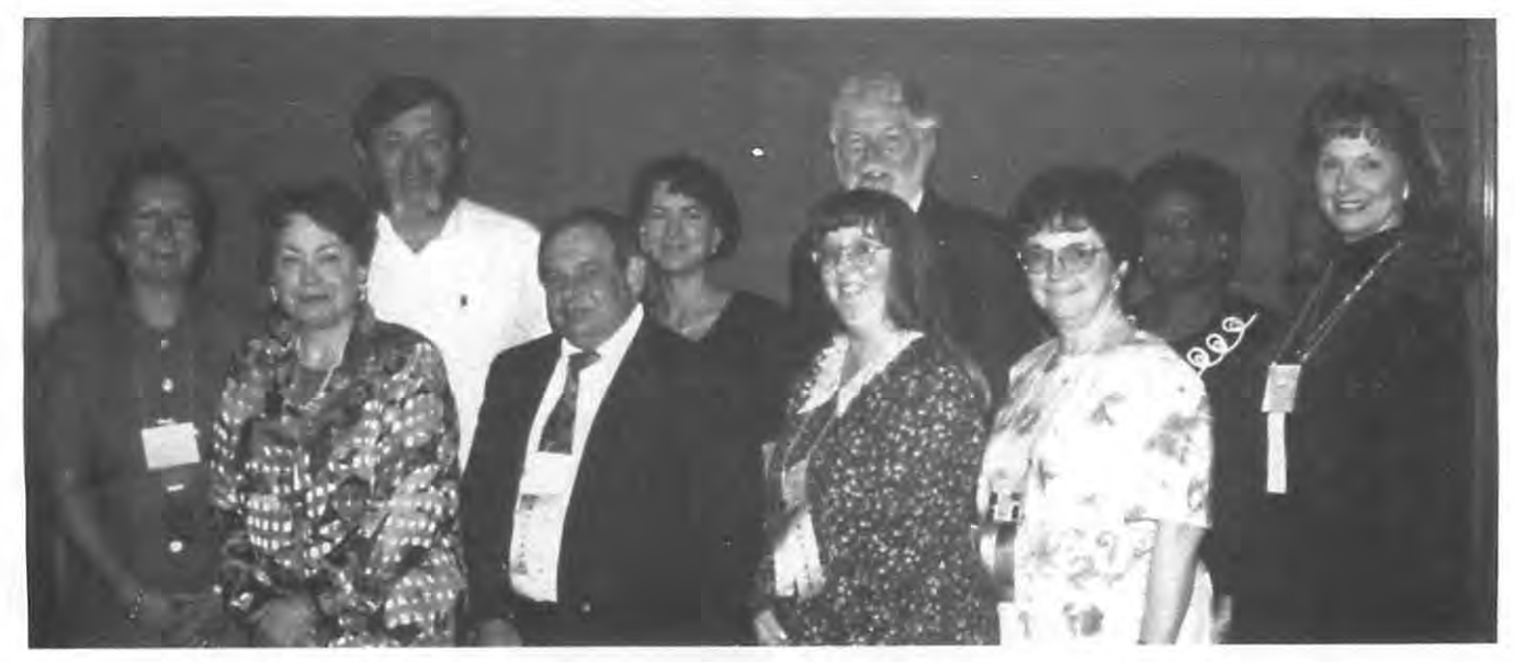
1998-99 MSRT Board of Directors