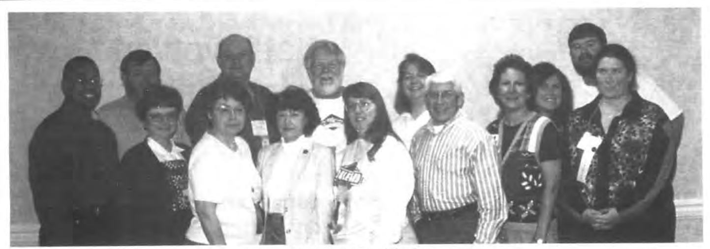
MSRT Past Presidents